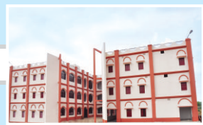
ग्रिजली कॉलेज ऑफ एजुकेशन (नॉलेज पार्क)