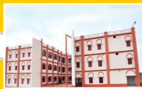
ग्रिजली कॉलेज ऑफ एजुकेशन (नॉलेज पार्क)